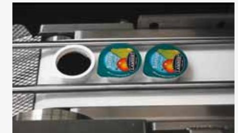
Photos top down: (1) Filling station in optimum design (2) Rotary-type machine for cups with seal lid closure, optionally with snap-on lid closure (3) "Stroop" in cups of 15 grs – 80 grs