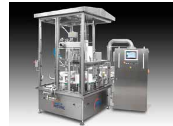
Rotary-type bucket filler