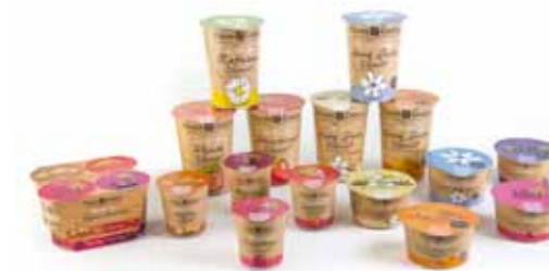
Selection of the wide range of high quality yogurts