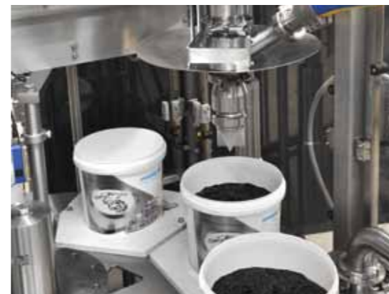
Filling station of the GRUNWALD-HITTPAC XL