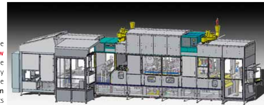
Inline machine FOODLINER 20.000 Ultraclean

They look forward to your phone call or to receiving your e-mail.