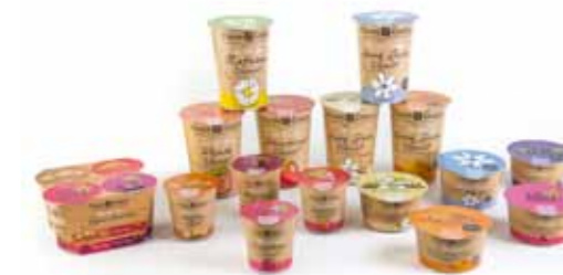
Selection of the wide range of high quality yogurts