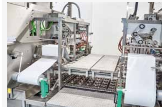
Photo below: View on the easily accessible cutting/sealing stations for plastic sealing film from the reel

GRUNWALD-FOODLINER 20.000 Width of the machine: 1,650 mm 4- to 2 x 10-lane design Approximately 14,400 – 50,000 cups/h Dosing range: 20 ml– 1,700 ml