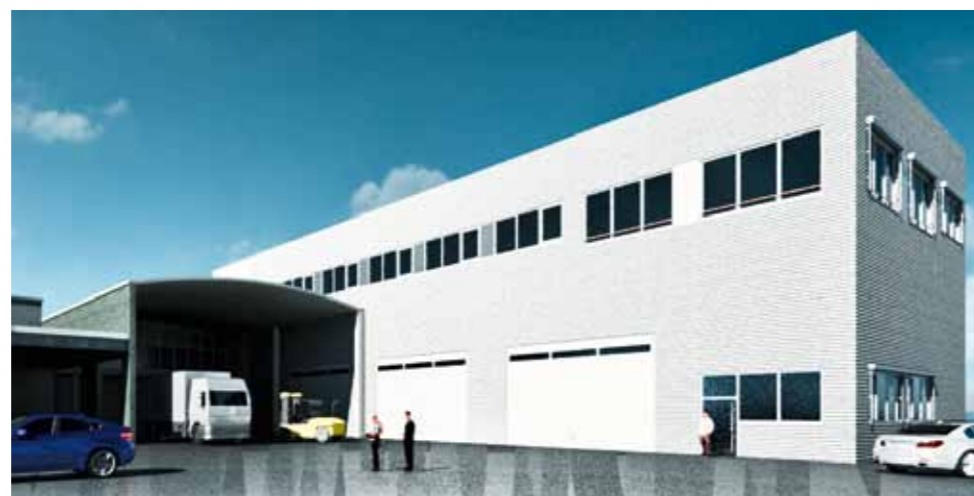
Photo below: 3D drawing of the planned new building