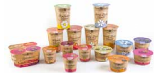
Selection of the wide range of high quality yogurts