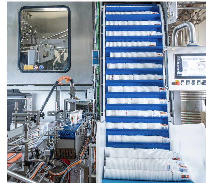
View of the operator-friendly low level storage system