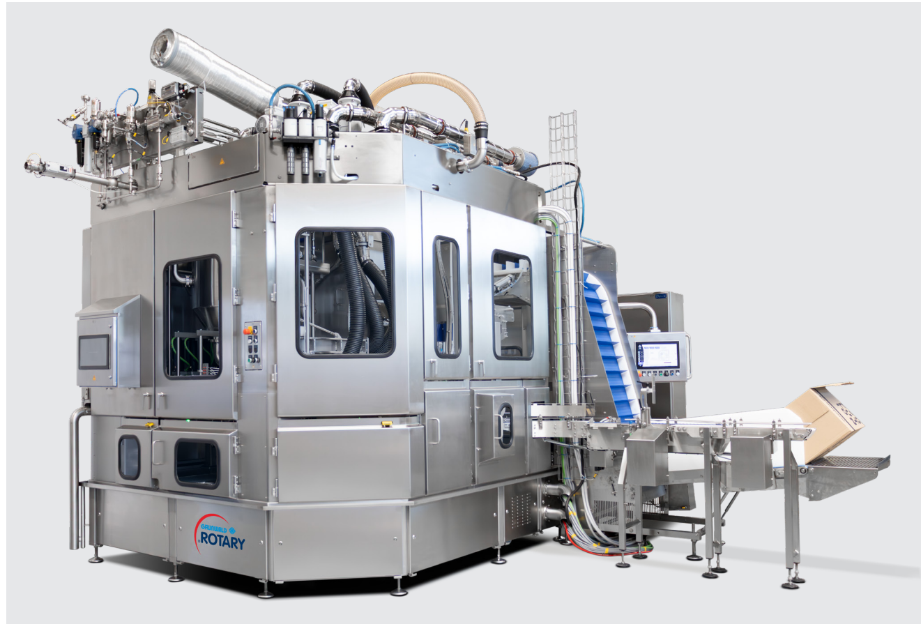
4-lane rotary-type machine GRUNWALD-ROTARY 20.000E-UC

Customised filling technology for Bayernland by supplying a highly flexible ultraclean (UC) rotary-type machine from GRUNWALD