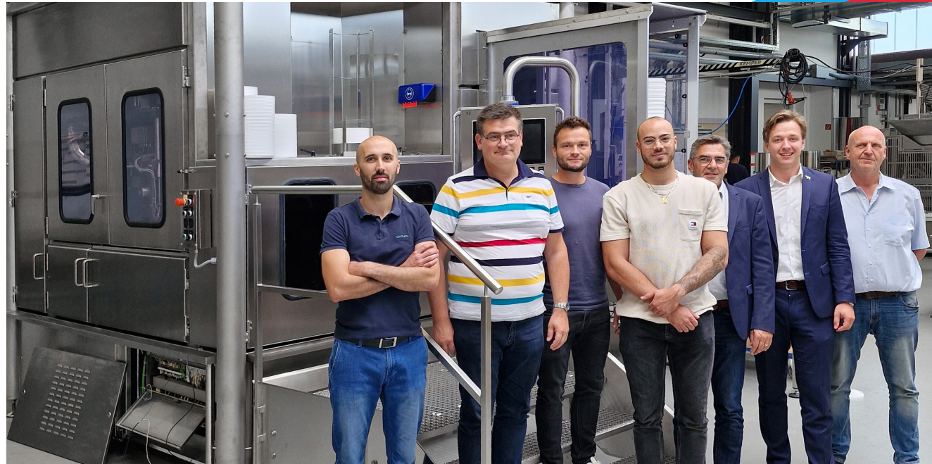
Photo after the FAT: the responsible project managers from Alsace Lait, our colleagues from GRUNWALD France and the personnel from GRUNWALD involved in the project

Alsace Lait relies on GRUNWALD technology to achieve greater flexibility and maximum hygiene standards