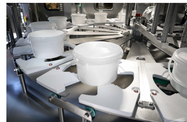
View into the bucket filler GRUNWALD-ROTARY XXL-UC/1

This hygiene concept meets the highest standards. A laminar cabin ensures clean air conditions in the filling area. The buckets are turned upside down, ionised and